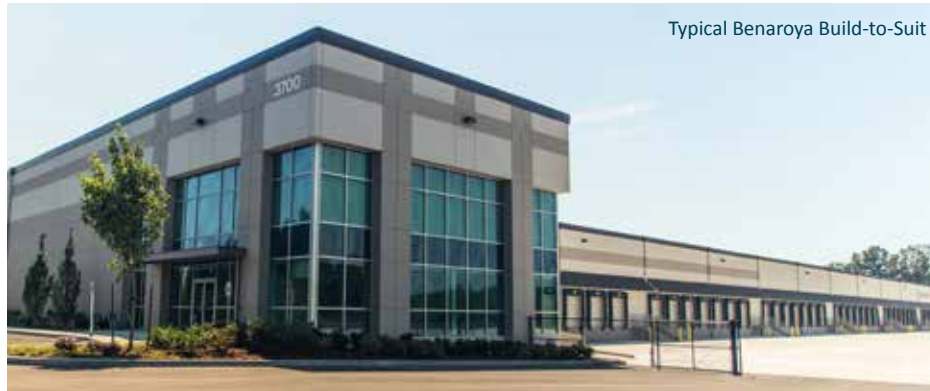
Typical Benaroya Build-to-Suit

Pacific Northwest Regional Logistics Center | Winlock