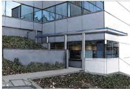
New Suite Entry