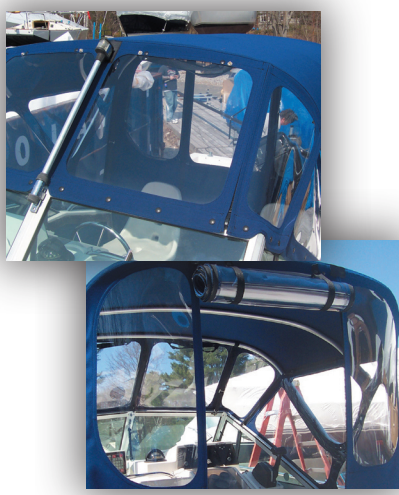
Uncluttered top interiors