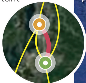
Dark Fiber to WBX: Control your own Network

The Centeris Transpacific Hub ® combines fast and secure connectivity with industrial IT power for businesses operating throughout important Asian markets and the U.S. that require high performance compute, storage, e-commerce, disaster recovery and cloud computing applications.