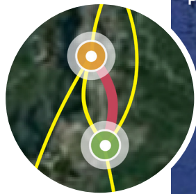
Six Pairs Dedicated Dark Fiber to WBX: Control your own Network

The Centeris Transpacific Hub ® combines fast and secure connectivity with industrial IT power for businesses operating throughout important Asian markets and the U.S. that require high performance compute, storage, e-commerce, disaster recovery and cloud computing applications.